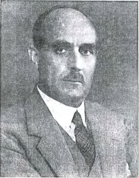
Dr. H. SPENCER JONES, F.R.S.