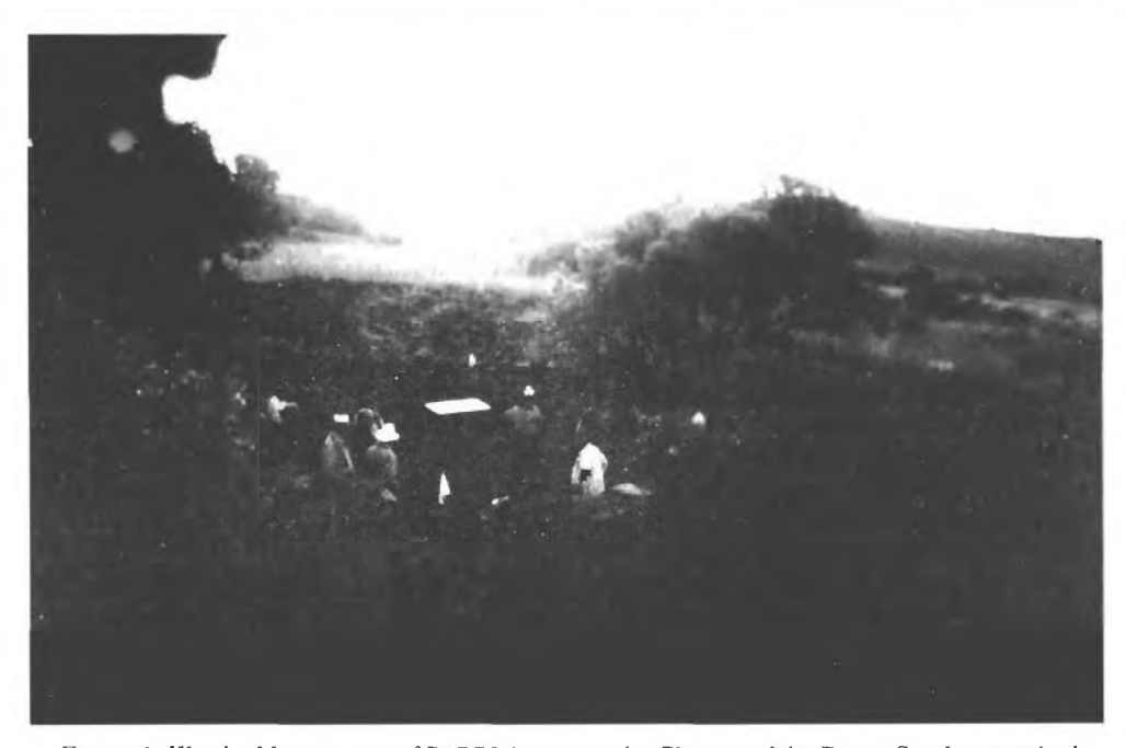
Figure 1. Watched by a group of SAPPI foresters, the Chariot of the Dying Sun has reached its final destination: it is the 21st of June, the year's end in the southern hemisphere.