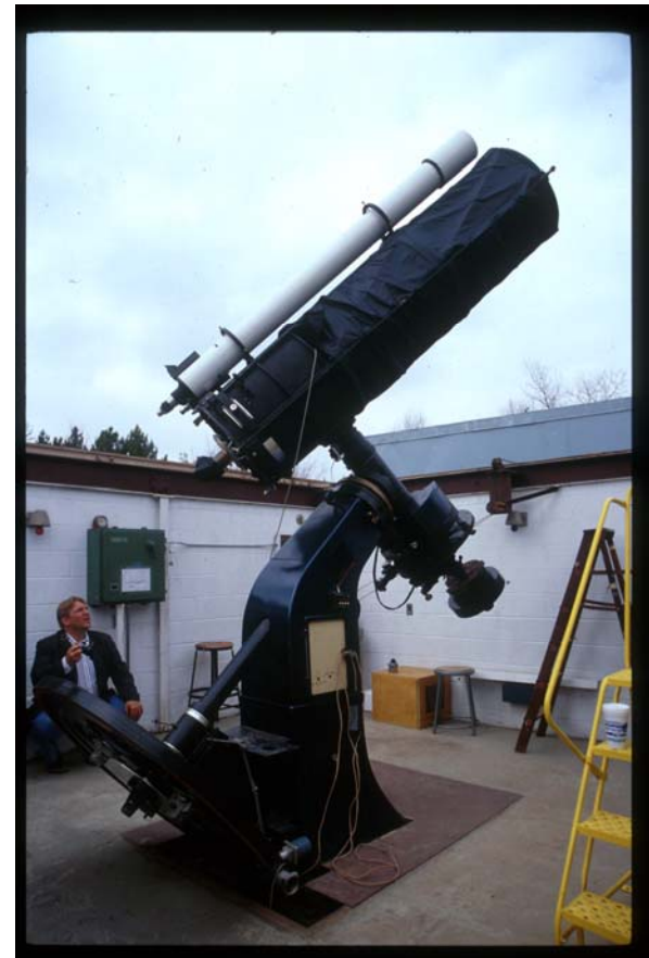
Peach Mountain Observatory 30 km outside Ann Arbor Amateur run