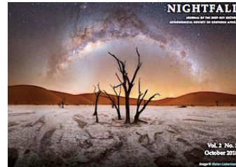
Vol. 2 # 3 October 2018