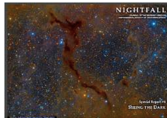
Special Report # 4, Seeing the Dark