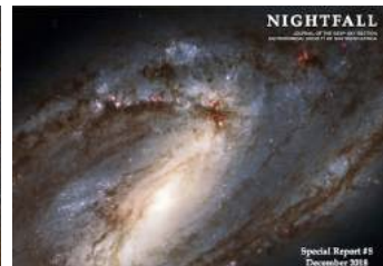
Special Report # 5, The Winds of change Are Blowing Over Aquila