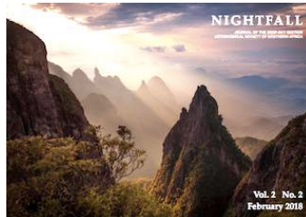
Vol. 2 # 2 February 2018

The Deep-Sky journal Nightfall issued 5 publications, whose covers are reproduced below, with links to the full online editions.